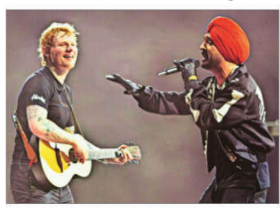
Ed Sheeran, seen with Diljit Dosanjh, had a sold-out concert in Mumbai in March. Sheeran is set to return to India in 2025

GIVEN THE EVOLVING GLOBAL dynamics, India is the new kid on the block which is opening to the world of 'experience economy'. A host of music concerts have been announced with some global artistes like Maroon 5, Green Day, Shawn Mendes, Louis Tomlinson coming for the very first time. Other artistes like Coldplay, Dua Lipa, Ed Sheeran are playing once again in India. This frenzy has also pushed local performers like Diljit Dosanjh to the forefront. The rise in disposable income has resulted in the significant demand surge for such concerts in India. The direct and indirect spending on these concerts spanning around two-three months will provide a major boost to the overall spending and consumption