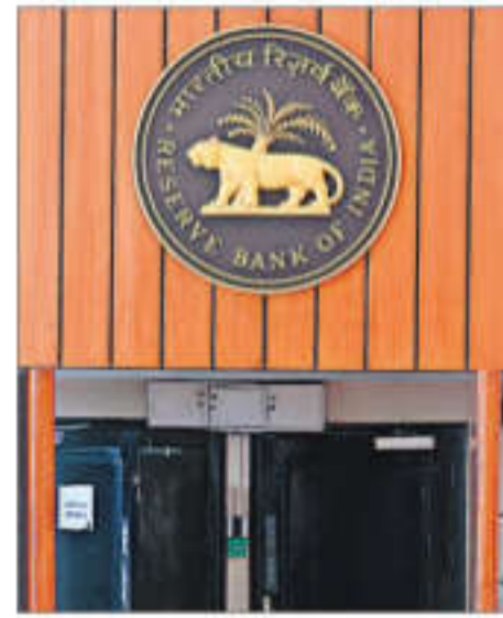
RBI lifted its FY26 GDP forecast to 7.4% from 7.3%.

"In the context of the stagflationary shock and exogenous nature of the event risk, we expect the RBI to keep rates on hold in April, while addressing specific pockets of strain. We expect a change in the policy stance towards tightness if there are material spillover