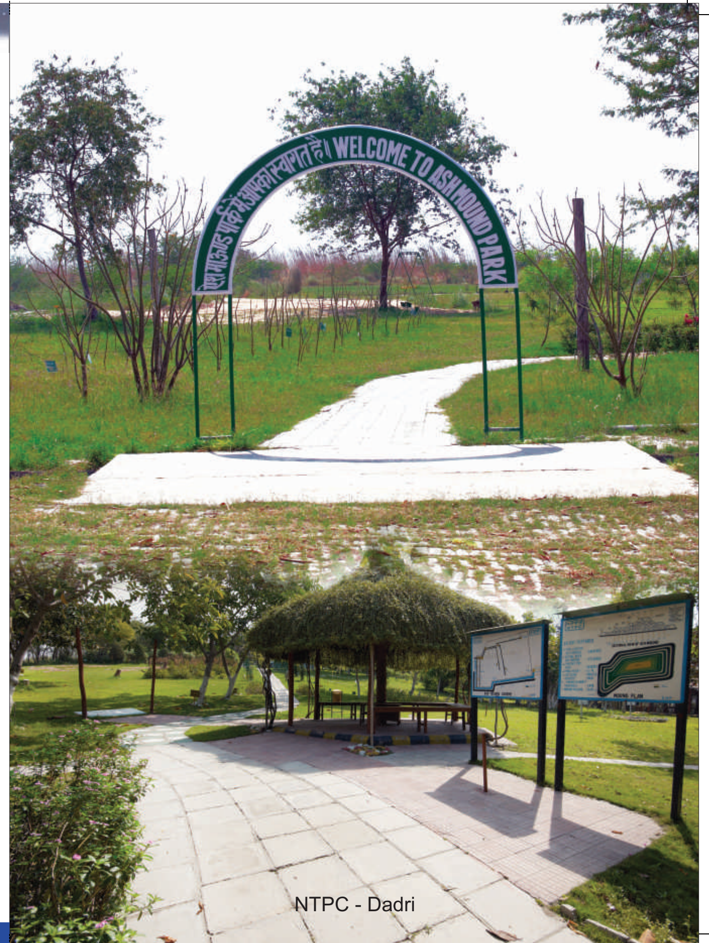
NTPC - Dadri